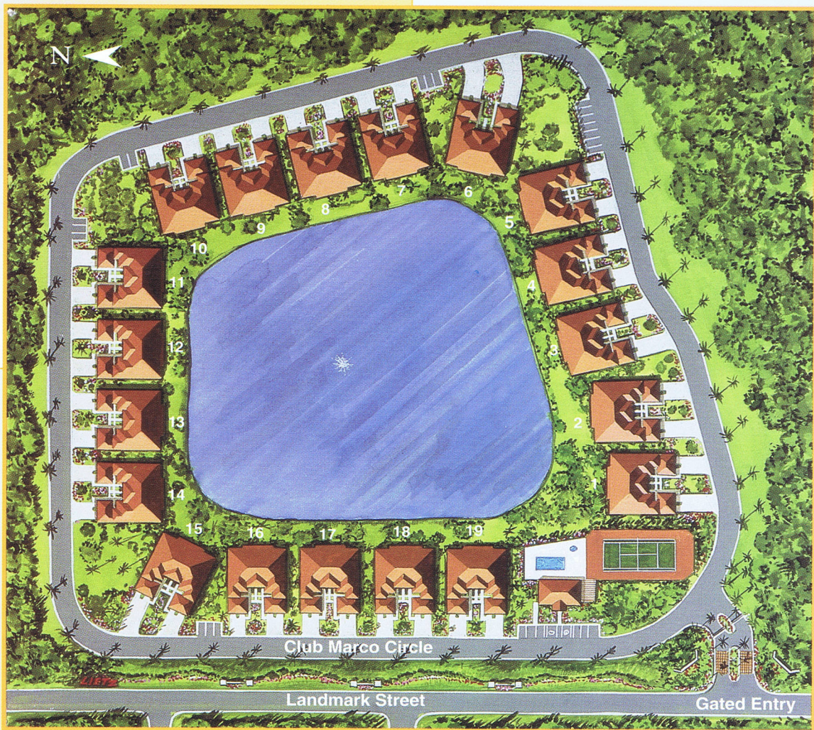
Artist's rendering not necessarily to scale and may be subject to change without notice.

Club Marco is a gated community of spacious Coach Homes overlooking an expansive three acre lake with a graceful lighted fountain.